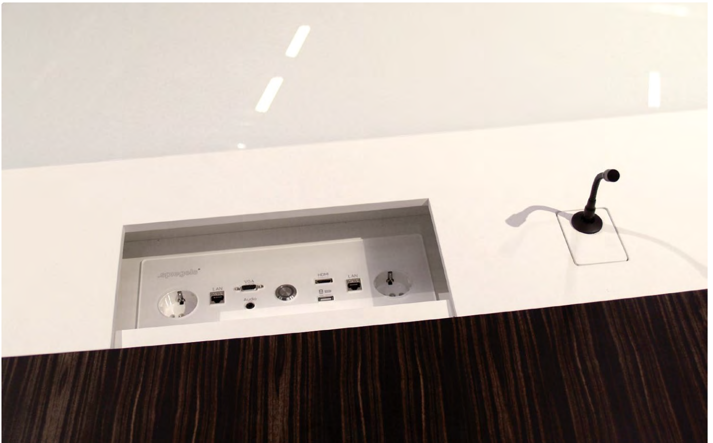
Photo: OEM variant microphone lift with beyerdynamic microphone