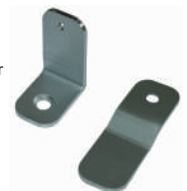
Mounting bracket for horizontal mounting